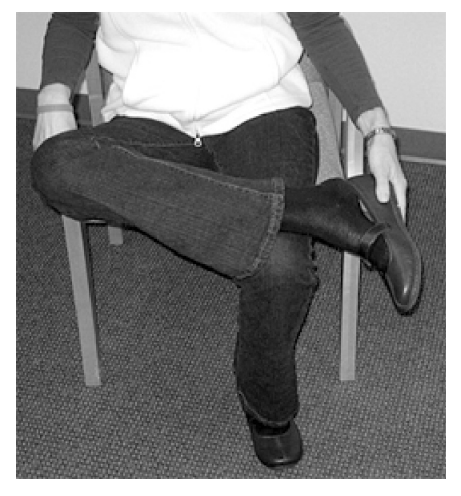
Figure 3 - recommended shoe donning position (right hip)

Remember, this is a safe position for your hip replacement and is recommended after hip replacement surgery.