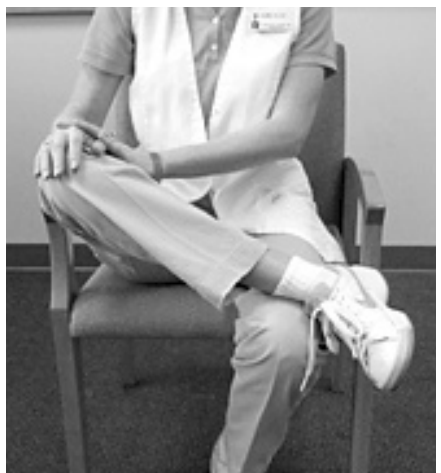
Figure 4 - Recommended hip stretch (right hip)